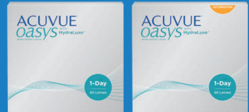
ACUVUE® OASYS 1-Day