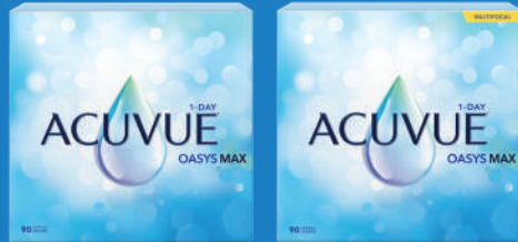
ACUVUE® OASYS MAX 1-Day

New to these Brands? You're eligible as a New Wearer.